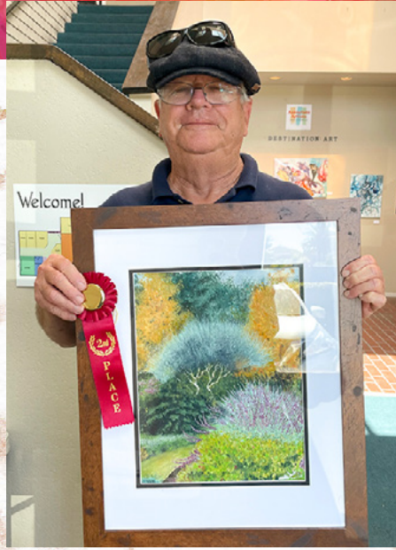
2nd Place "Landscape" Bill Wassenberg