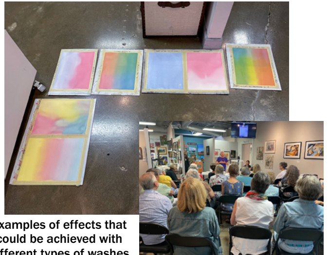
Examples of effects that could be achieved with different types of washes

Nancy Caldwell began by showing examples of different types of washes. She went on to demonstrate how to create them. One key is to have enough paint ready. You can't begin a wash, then run out of paint halfway through the process, and have it dry out on the paper while you scramble to mix more paint. One thing Nancy does to avoid this issue is to mix her watercolors, and store the fluid paint in bottles, ready to use.