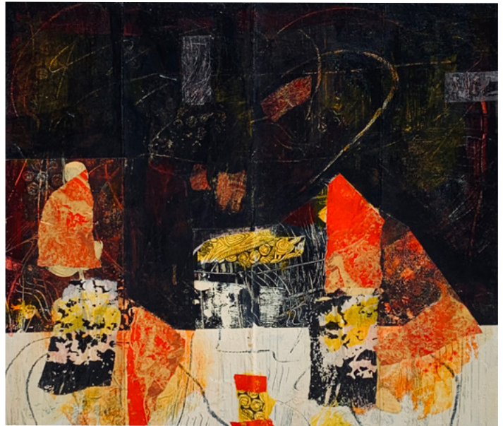
Baba Ghanoush mixed media