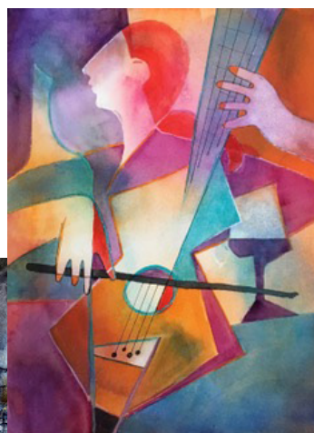
The Young Cellist