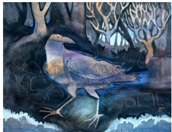
A Crow Sneaks Through the Forest