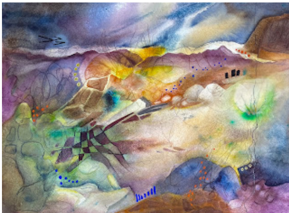
Seasons in the High Desert