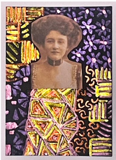
Art created by Alvin Takamori during SBWS meeting