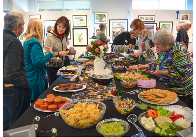
Table full of food at the SBWS Reception Dec. 9